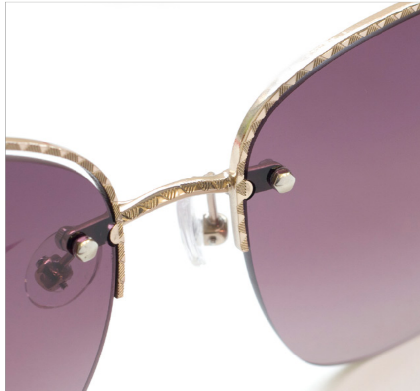
Vintage inspired engravings