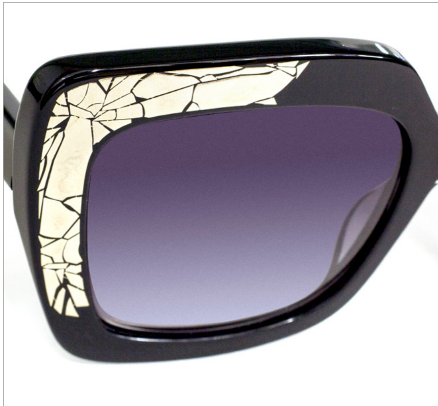
Broken mirror metal pattern