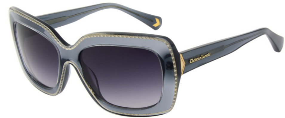
954 Gris Sauris

AMENDS: Add AR coat to reverse of lens CODE CL5073 SIZE 55/16-140 B 42