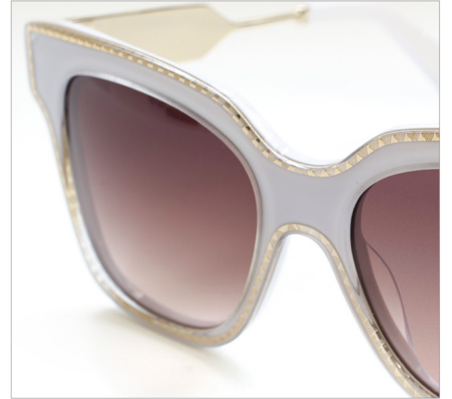
Inset metal with vintage pattern