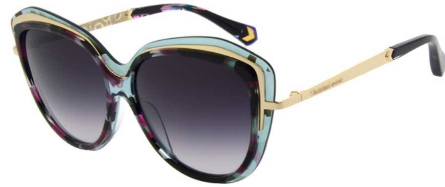
515 Kaki Multi