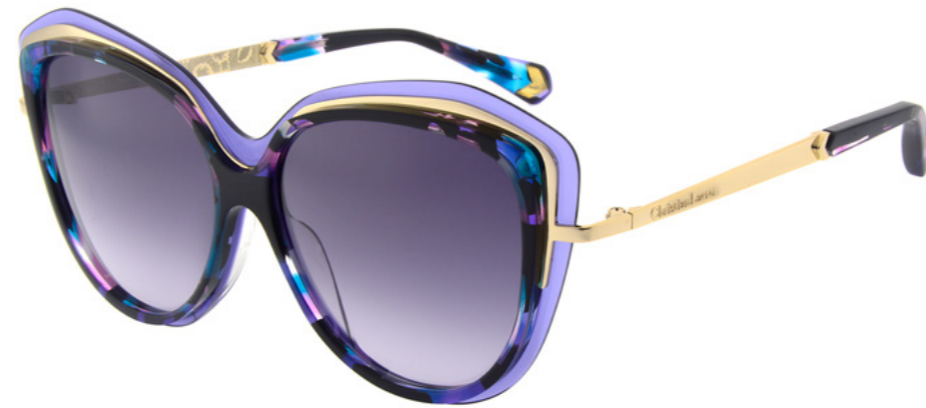
717 Violet Multi

AMENDS: Add AR coat to reverse of lens CODE CL5069 SIZE 55/13-135 B 51