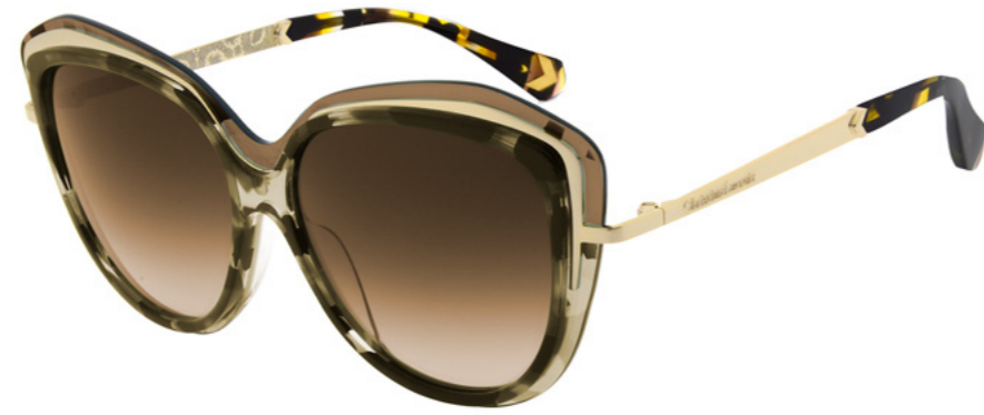
114 Ambre Multi