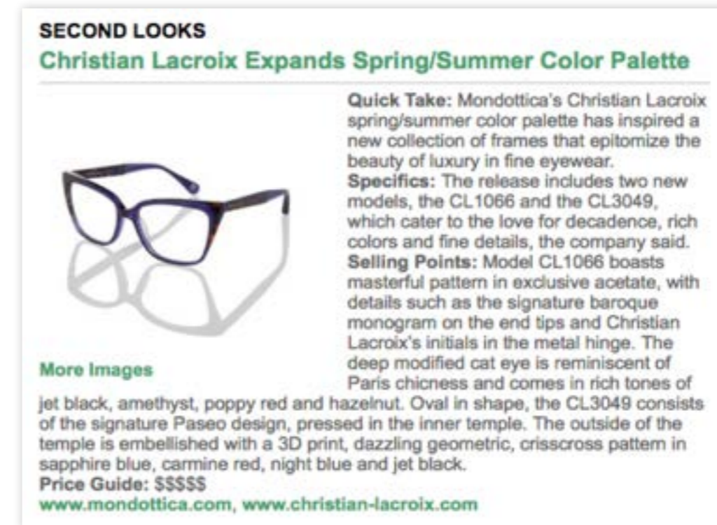
Trade Vision Monday - United States Website & Twitter Style: CI1066