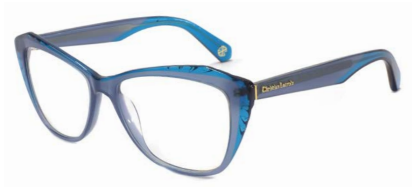
660 MILKY BLUE