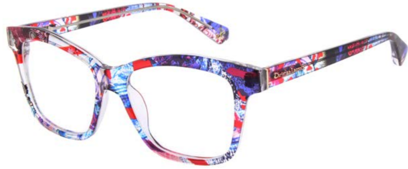
265 B&R FRAISE