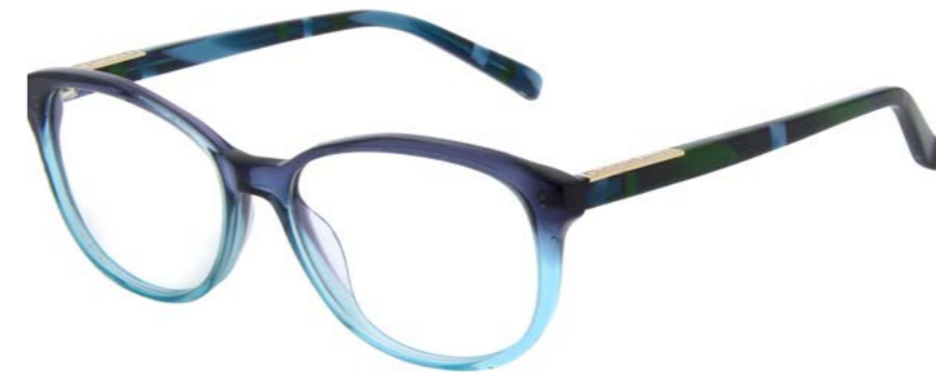
621 BLUE FADE