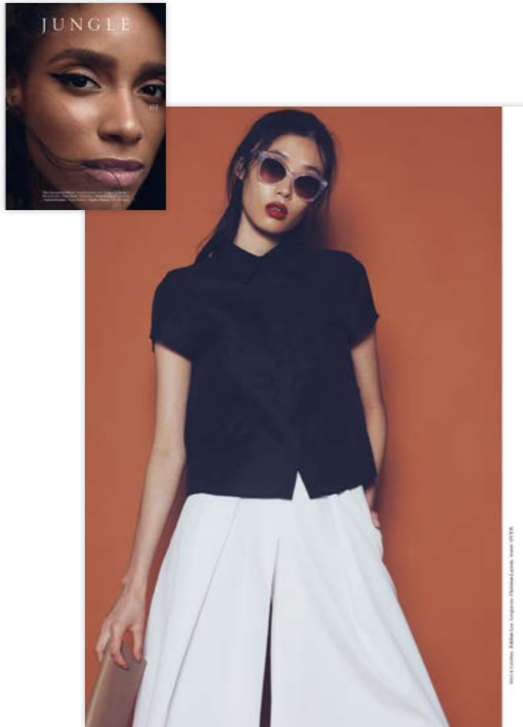
Consumer Jungle Magazine - International Style: CI5049