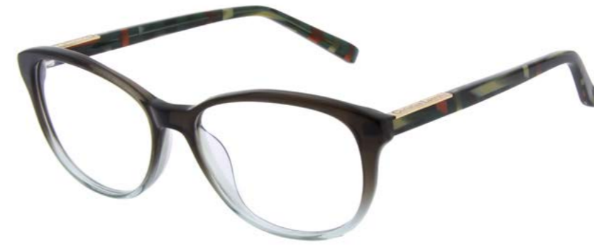
927 GREY FADE