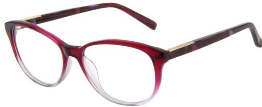
722 BURGUNDY FADE