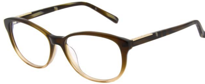
125 BROWN FADE