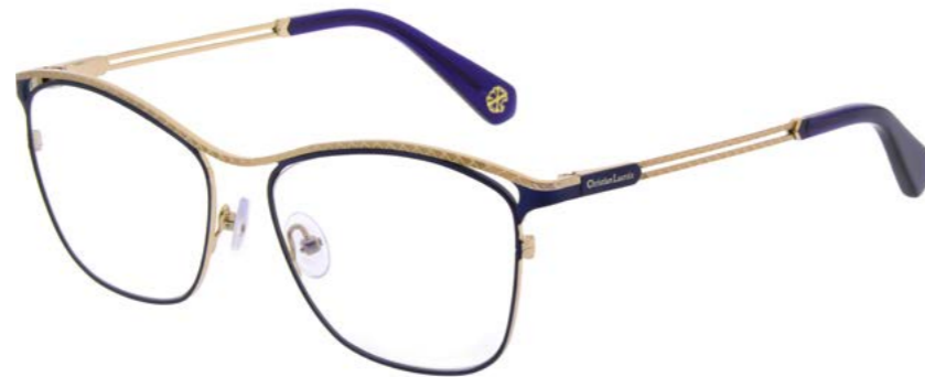
689 NIGHT BLUE