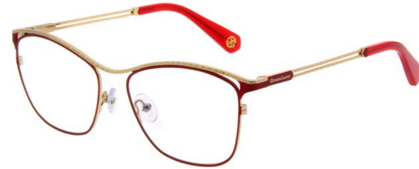
293 ROUGE CERISE