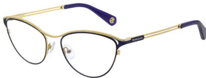
689 NIGHT BLUE