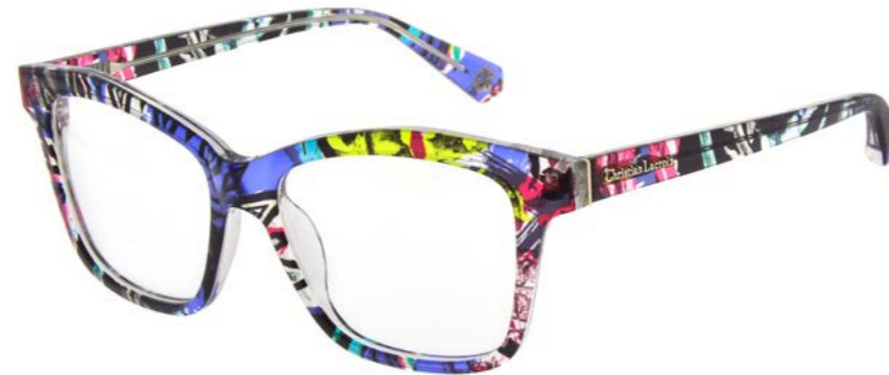
659 B&R BLEU