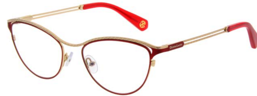
293 ROUGE CERISE